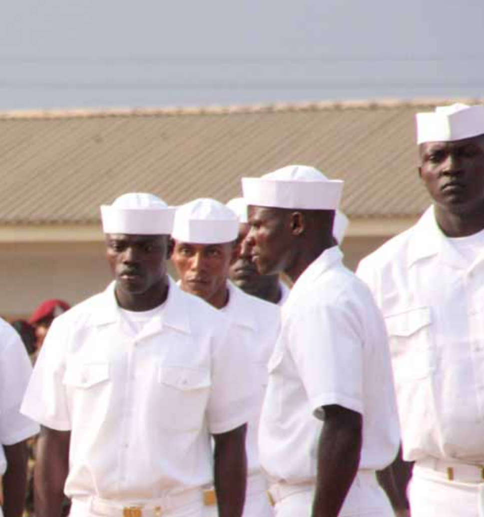
Public Affairs/Ministry of Defense